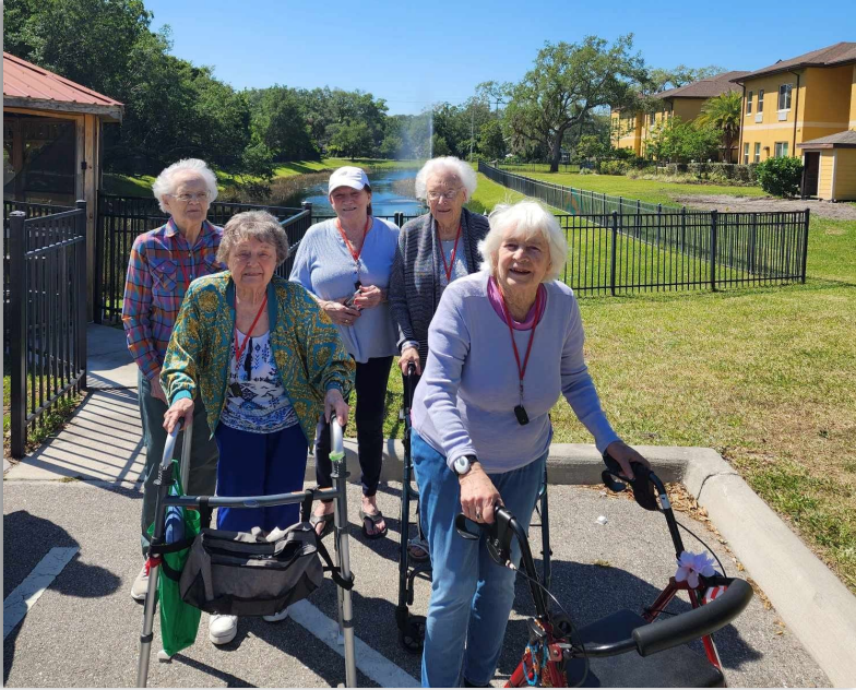
Morning walk to feed the swans.

This Florida heat is no joke. We have had record high temperatures that feel well over 100 degrees outdoors. This heat has kept us indoors the majority of the day except for the morning routine.